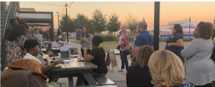
Happy Hour at The Flying Saucer