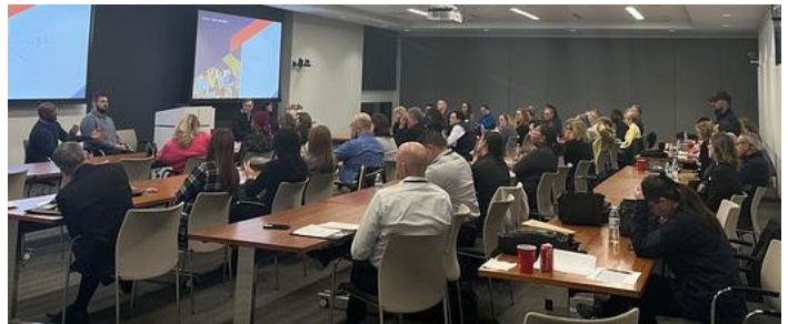
Chapter Meeting at Toyota